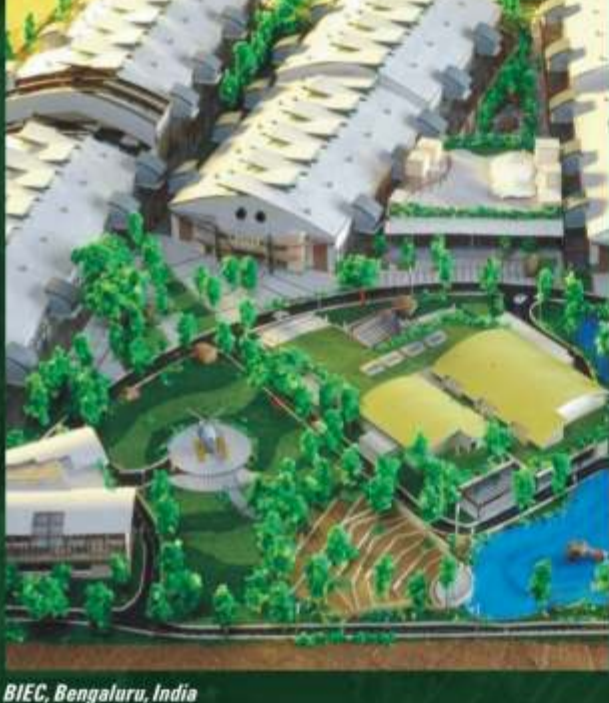
BIEC, Bengaluru, India